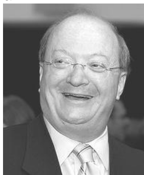
Senator Hugh Segal.