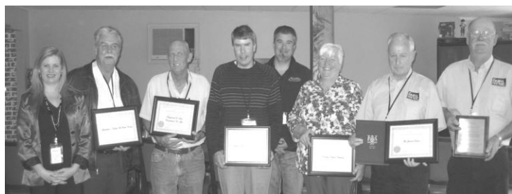
Left to Right: Sprackin's Kitchen & Bath Centre, Raymond D. Deir Construction Co. Ltd., Smith's Farm Equipment (Jasper) Ltd., Country Kitchen Catering, and The Gravel Doctor.

This year saw six businesses nominated: County Kitchen Catering, The Gravel Doctor, Raymond D. Deir Construction Co. Ltd., Spracklin's Kitchen & Bath Centre, Potter's Small Engine, and Smith's Farm Equipment (Jasper) Ltd.