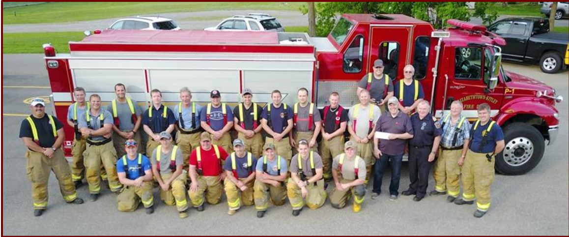
Elizabethtown-Kitley Fire Department Volunteers

The Fire and Emergency Services, also known as the Elizabethtown-Kitley Fire Department (EKFD) is comprised of a dedicated group of volunteers responding to calls from three Fire Stations. Station 1, located at 44 Main Street East Lyn, has staff on hand during the weekdays.