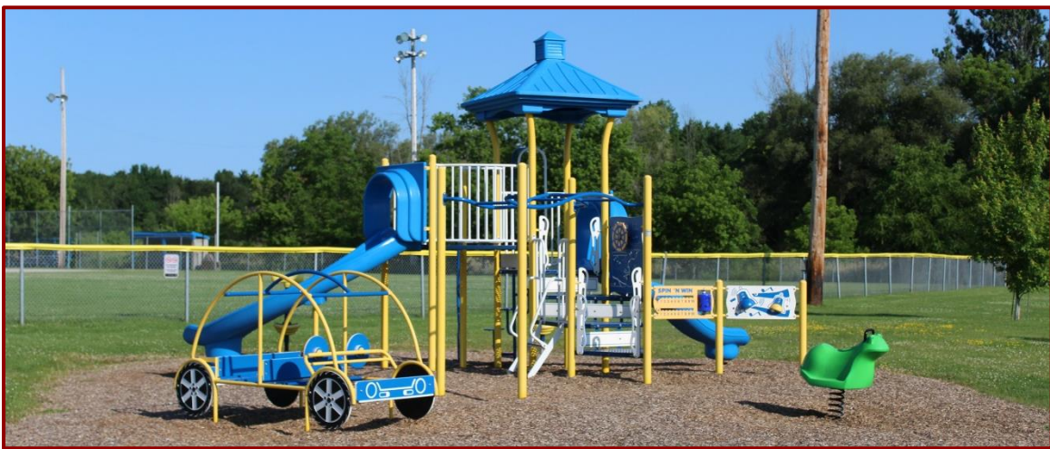
Douglas A. Scott Play Structure

Douglas A. Scott Memorial Park (11 Victoria Street, Lyn) has an active minor ball league run by volunteers across its three ball diamonds. The park also has a playground, basketball nets and shade pavilions.