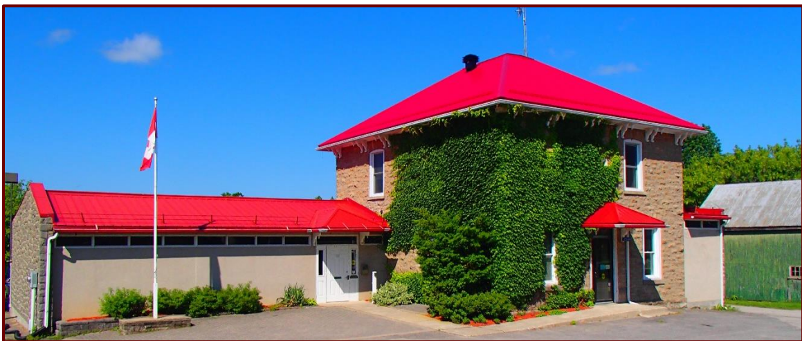
Township New Dublin Office