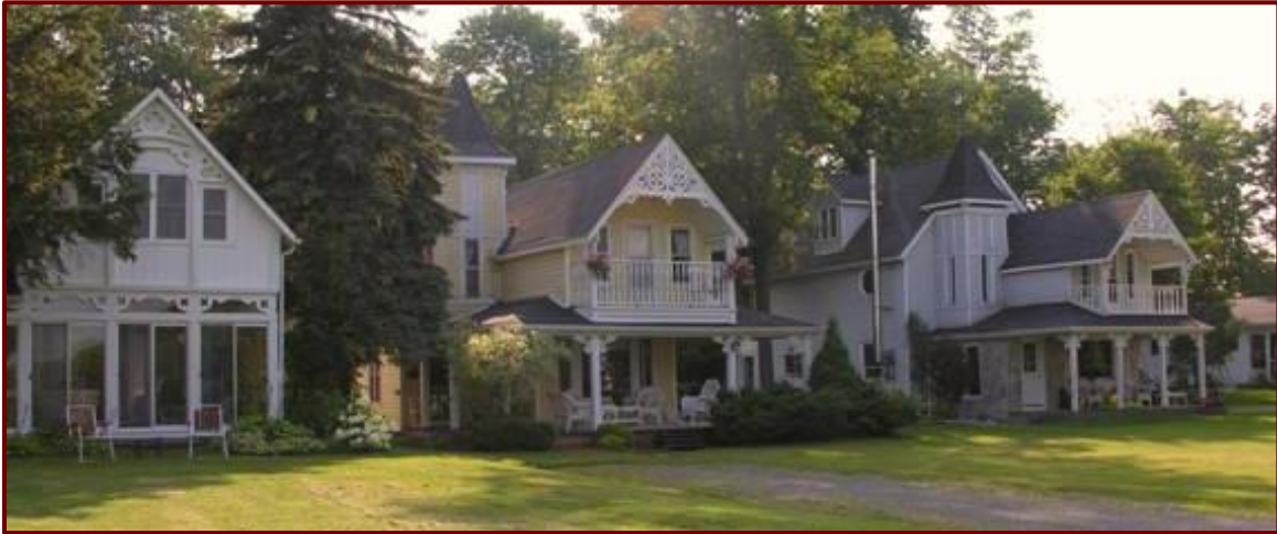
Residences along the St. Lawrence River

Every property has unique Zoning and Official Plan designations. Our Planning and Development staff are here to help you with your inquiries and proposals.