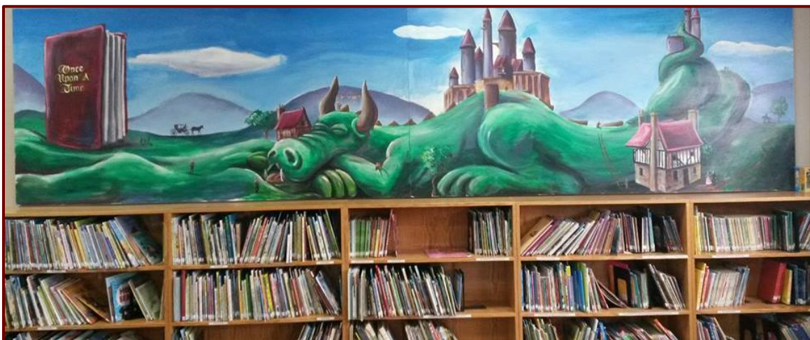
Spring Valley Branch Kids Area